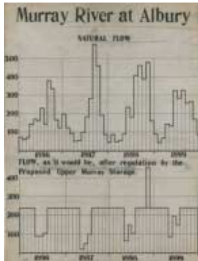
The predicted effect of the Hume Dam on the flow of the Murray River, c1920. NAA: MP146/4, 7

The exhibition looks at how, over the last 100 years, Australians have been very busy replumbing Australia. We've caught vast