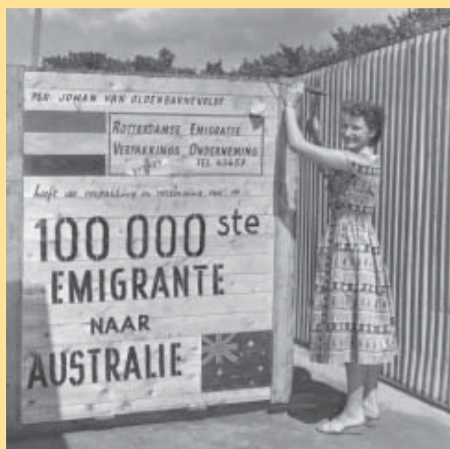
(opposite) Two Dutch families with their 20 children arrive in Melbourne aboard the Fairsea in 1955. Simonis family (left) and Vesteegens family (right). NAA: 12111, 55/4/113

Today, due to natural attrition and return migration, there are close to 95,000 residents in Australia who were born in the Netherlands. A further 240,000 Australians claim Dutch ancestry. Over the last 50 years, the Dutch have had a huge impact on the building and construction industry in Australia and have contributed significantly to the scientific, artistic and economic development of the country they now call home.