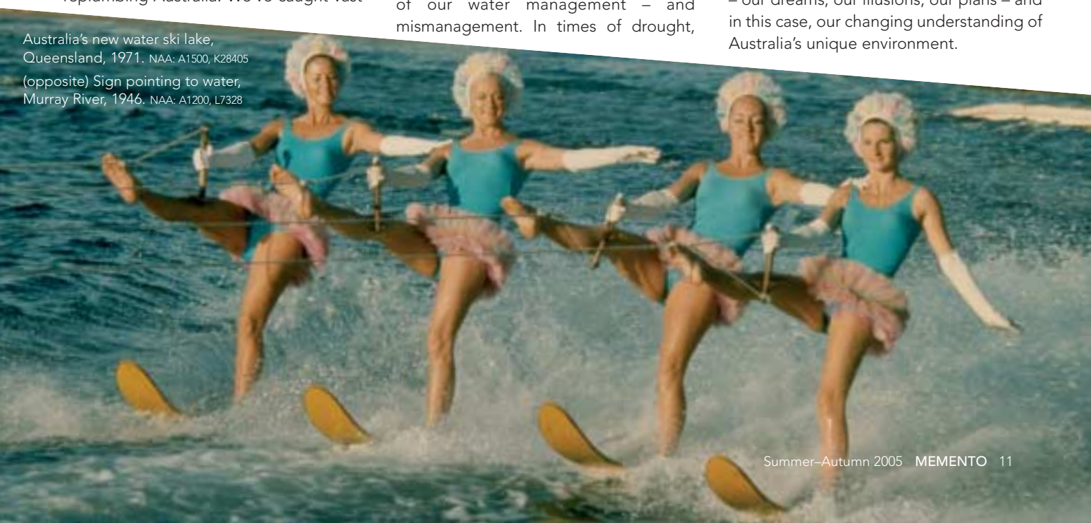
Australia's new water ski lake, Queensland, 1971. NAA: A1500, K28405 (opposite) Sign pointing to water, Murray River, 1946. NAA: A1200, L7328

The graphs of Australia's mightiest river, the Murray, capture on just one piece of paper so much of what the exhibition is about – the dreams of water management that became working schemes and changed the face of Australia. The graphs also illustrate how determined we have sometimes been to work against the natural flows of Australian rivers. Australian rivers naturally flow with the high peaks and deep troughs of the first graph, not the regular streams of the second, which resembles the flow of a European river. This document, preserved in its brown-paper bundle, reminds me once again of how central our collection is to understanding Australia and Australians – our dreams, our illusions, our plans – and in this case, our changing understanding of Australia's unique environment.