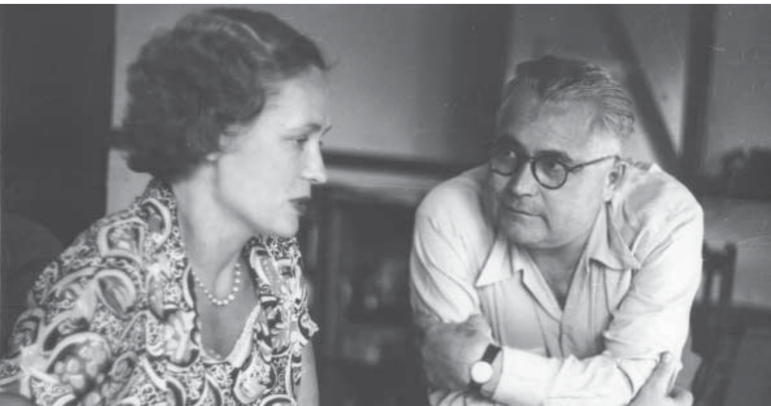
Evdokia and Vladimir Petrov inside the safe house where they were held following their defection to Australia.

This year marks the 50th anniversary of one of Australia's greatest political stories of the Cold War era – the Petrov Affair.