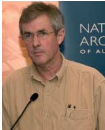
Don Watson , former prime ministerial speechwriter, talked about the decay of public language to an interested Speaker's Corner audience at the Archives in Canberra last October.